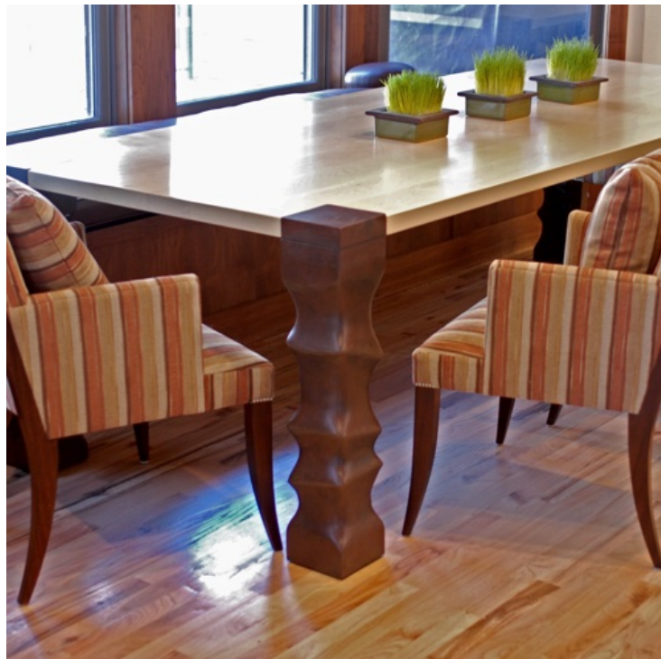
"Dining Room Table Custom G" maple top, poplar carved legs, 8' x 44" x 29"

While painting murals for a client's hotels throughout the southwestern United States (many on Indian Reservations), as well as time spent working in Africa, I developed my passion for makers, ceremony, and the significance of details.