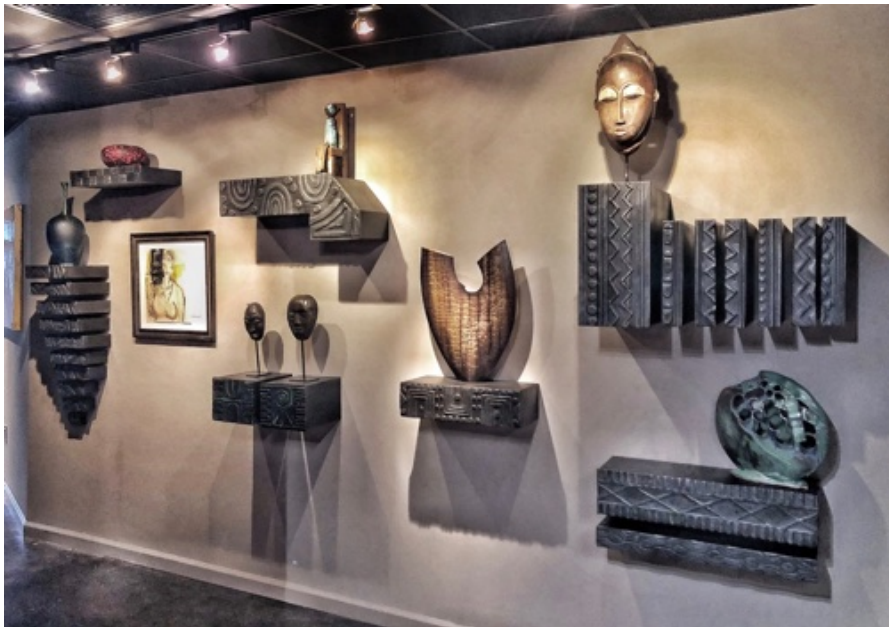
"Shelf Installation" (18' wall) wood, assorted sizes

As a multidisciplinary artist, I have a large toolbox to create sculptural pieces that inject an out-of-the-ordinary surprise to a utilitarian object. These uncommon and distinctive elements will change the energy and style of the décor.