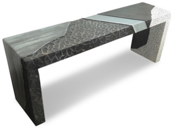
"Custom Table Bro" wood and inlaid titanium, 48" x 12" x 16"

These particular cultures have shaped my aesthetic and remain at the core of my work. I blend and bend these references and ideas not only as visual pleasure, but also in celebration of the care and details of the rich visual history these cultures offer.