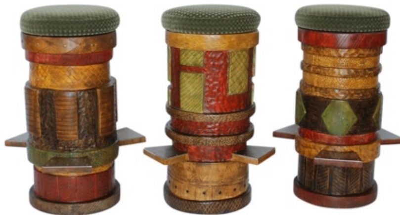
"Custom Bar Stools" aspen logs, metal covered footrest and custom upholstered swivel seat, Approx. 12" x 25"

An interest in welding and woodworking turned my practice sculptural, creating totemic sculptures and carved wood figurative pieces. I started using these hand-carved textures and techniques in my furniture, home accents and architectural elements.