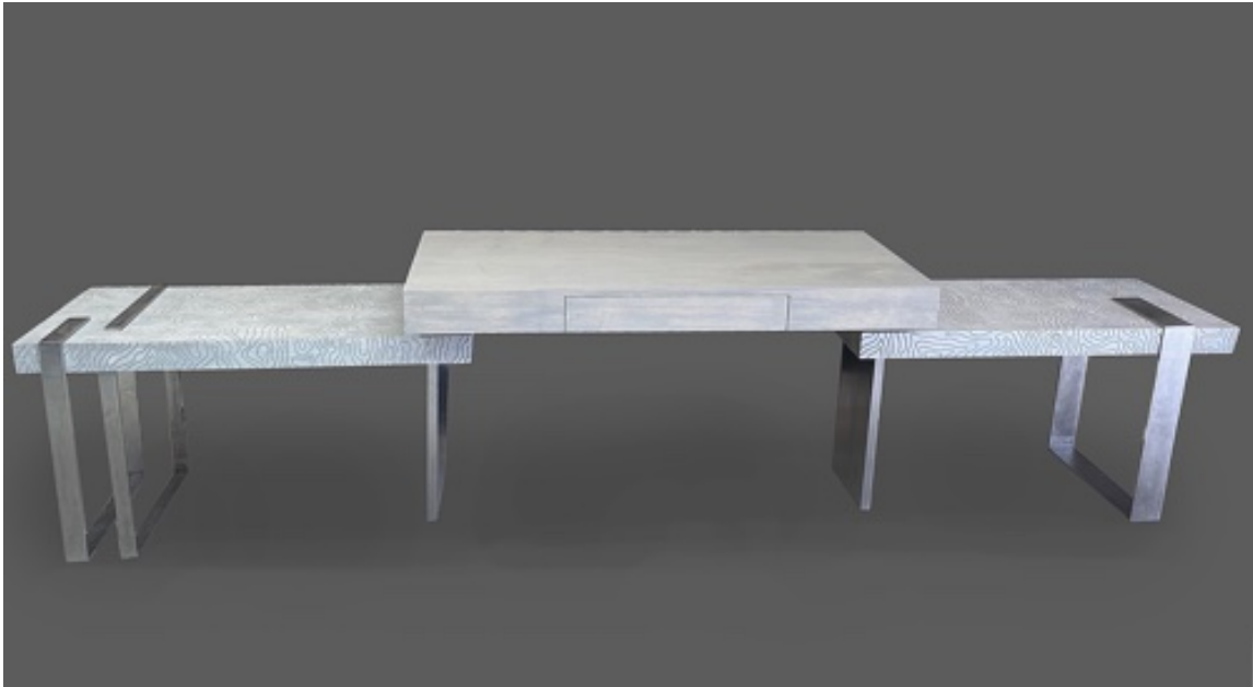
"Custom Console/Desk" wood and steel, 11' x 26" x 19"

Surface treatments are the result of meticulous carving and contrasting textures; the design element is infused with a modern edge. The need to touch and the tactile quality is an aspect I want to promote.