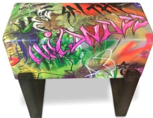
"Literaffiti Bench Wildness" steel tube hand-painted with wood pedestal, 18" x 8" x 17"

I gravitate towards a strong design sensibility with bold components.