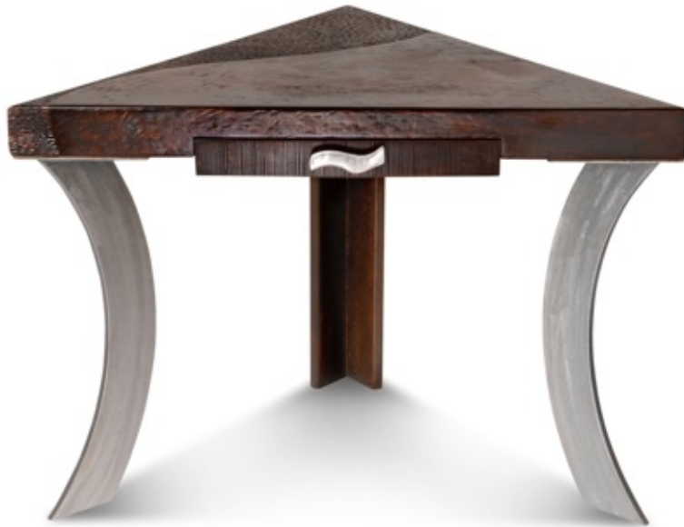
"Corner Writing Desk" wood and metal, 36" x 28.5"

While painting murals for a client's hotels throughout the southwestern United States (many on Indian Reservations), as well as time spent working in Africa, I developed my passion for makers, ceremony, and the significance of details.