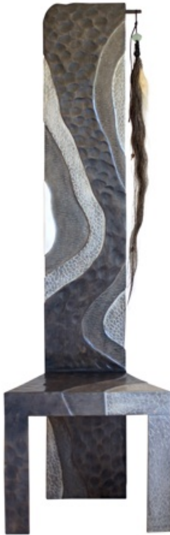
"Chiquita Chair" wood and horse hair, 12" x 10" x 60"